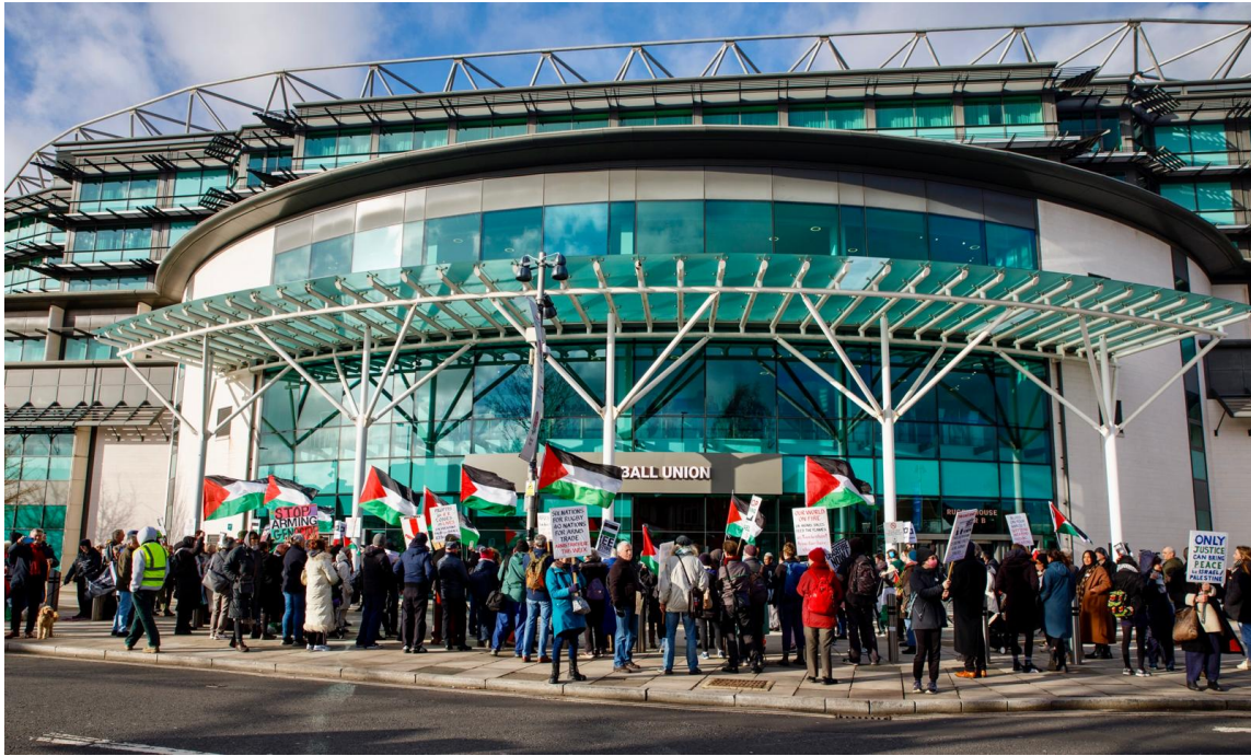
Protest outside Twickenham Rugby Stadium in Jan 2024