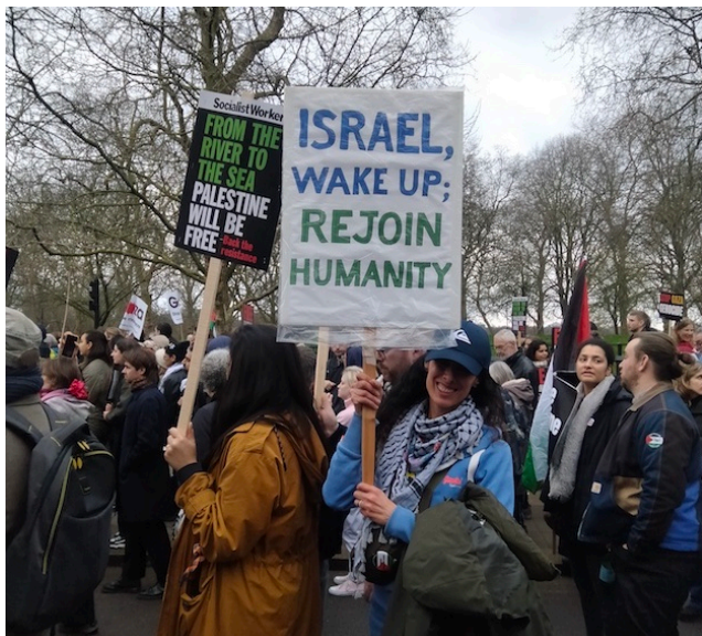
Martin's placard (see Page 6)

KPC members have joined the recent marches in London calling for justice for the Palestinian people, an end to Israel's violence, and for a ceasefire in Gaza. The latest, on 18 May, commemorated the 76th year of the Nakba, when over 700,000 Palestinians were driven from their homeland by the newly created state of Israel. The Nakba (Arabic for catastrophe) is ongoing and each year we march to remind the world of the injustices suffered by the Palestinian people. This year the march had added urgency, with Israel's ethnic cleansing reaching unimaginable levels of brutality in Gaza.