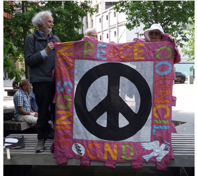
KPC outside the US Embassy

On 11 May there was a National Day of Action, led by CND. The various actions included a protest at RAF Lakenheath and a rally outside the US Embassy in London, in which KPC took part.